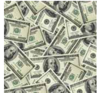
Over $790 billion in economic stimulus, in the absence of any new revenues, basically amounts to the government printing that much extra money.

The votes last Friday were an anticlimax of sorts, capping a week of furious negotiations between House and Senate